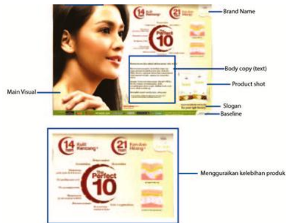
Figure 3. Layout Format Analysis

are made with the upright, and the picture large. This product is intended for consumers who live in the tropics and practical consumers, as seen from the form of ads that contained only the product, headlines and text, and not too much use of words, other than that this product can not only economic benefits but also provide benefits for skin health consumers because these products have to conduct clinical trials to determine their possible allergy products.