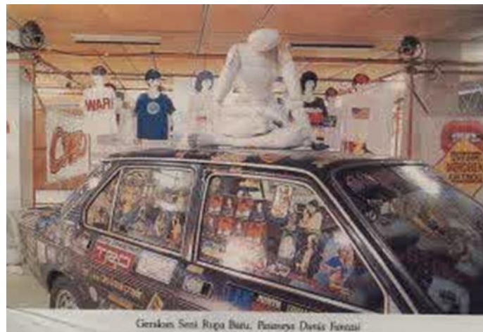
Figure 2. One of Works in Pasaraya Dunia Fantasi's Exhibition, GSRB