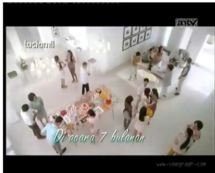
Figure 1. Iklan Susu Lactamil