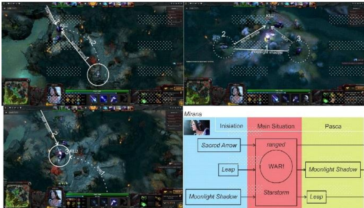
Figure 4. Miranas skills and interaction with another heroes (doc)

Mirana is an agility hero. The agility is a type of hero in DoTA2 which is capable of playing weapons, relying on hand speed, and has a good movement. This ability increases damage received by the enemy. Furthermore, the combination of attack and escape skills favored by players such as Secret Arrow, a unique skill owned by Mirana only, is able to knock out an enemy, stun, and deal damage as far as the arrow launched. Second, Leap serves as an attempt to save himself or enters into the battle, but many players use this skill to avoid war because Mirana has a little health.