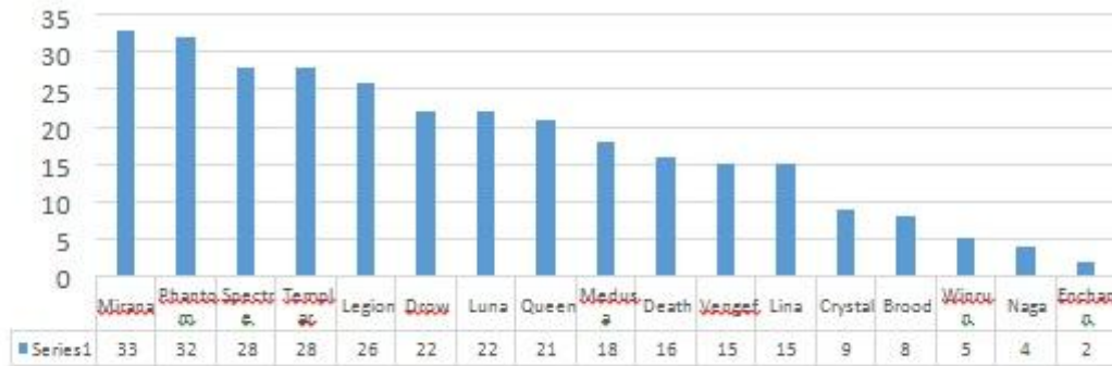
Figure 1. Rank of DoTA 2 female heroes strength(doc)

Players choose Mirana as the strongest female hero in DoTA2 with a total value of 33, followed are Phantom Assassin, Spectre, Templar Assassin, Legion Commander, Drow Ranger, Luna, Queen of Pain, Medusa, Death Prophet, Vengeful Spirit, Lina, Crystal Maiden, Broodmother, Windrunner, Naga Siren, and enchantress.