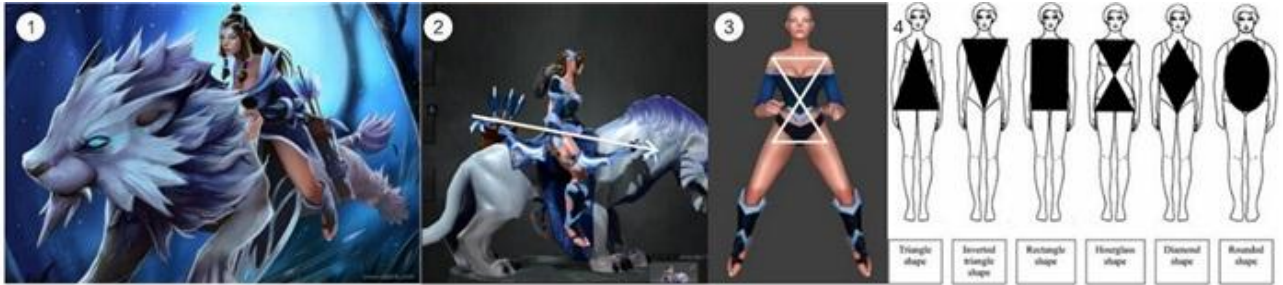
Figure 2. Shape of Mirana (2014, dotafire; 1); Mirana with a bow (doc; 2); Mirana with hourglass body shape (doc; 3); Female body shape (2014, fashionbeautyexpert; 4)

Mirana, known as the Princess of the Moon, is a daughter who will continue the throne of the solar system but decided to serve the Moon Goddess. Mirana riding a huge tiger, she is ready, proud, and fearless. Mirana use bow as her weapon, complete with a projectile like an arrows, so she can attack the enemy from a considerable distance. There are gaps in the use of weapons, allowing the character in a safe state. Mirana occupy a group namely the Radiant, it is human class, a white magic, and a kindness. This character is positioned in a good state. It also shows that female character traits in gentle, loving, or even weakly retained in this game.