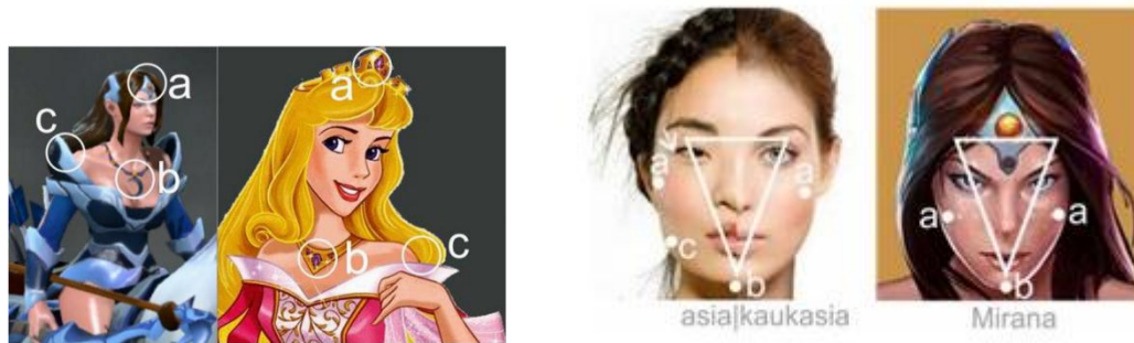
Figure 3. Mirana and Princes Auroras atributes (a) crown, (b) necklace, (c) royal dress (doc; left);

Mirana, has a hourglass type of body shape. It seen from the size of the stomach and narrow waist, wide chest but sleek abdominal area and enlarged in toe area. Based on this small body shape, it can be said that this character has large breasts with a solid hip. Hips shows, that this character always actively using his body to move. Overall body looks fit with the female form in general.