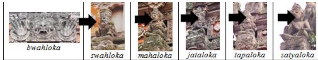
Figure 02: the events of man's spiritual journey (reading from the bottom to the top of the building)