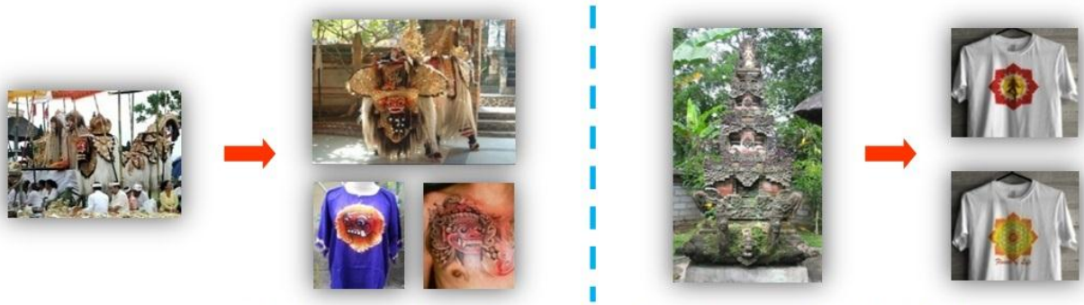
Figure 3. 'Reinterpretation' Process Against Concept of 'Hybridity'