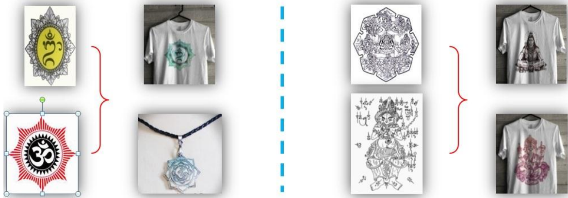
Figure 2. 'Reinterpretation' Process Against Concept of 'Paradox'

Understanding figure 2, can be stated that paradox offers that something is controversial, but it makes a designer feel happy and comfortable to experiment to do 'think more buildless' (thinking a lot about the concept of something that does not have to be built), presenting its nonexistence or negate the presence (the presence of absence or the absence of presence), and build by not having to build it, dismantling and destroying it first (in order to build, you must not build and to construct is to deconstruct). Experimental Concepts (idea) like that is beneficial to enrich the inner and spiritual experience of the designers through exploratory and contemplative approaches without targeting that the object will be realized or not. Based on the history of paradox, it has been developed as a meaning to criticize and to describe a critical point which suggests an alternative way in doing something. It is defined as an ironic levels which contains humor and when the subject becomes worldly, often like seeking God. For designers who make mistakes in understanding and use of paradox as a channel of their creativity, it could lead to a judgment, isolation and ostracism, even humiliation of the public group. Therefore, the fundamental errors must be avoided by a designer.