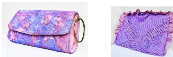
Figure 2. Research of Utilizing Brocade Fabric Arumsari (2010)

Textile leftover that is gained from production process at TPT (Tekstil dan Produk Tekstil) Industry comes in various types, of which one of them is brocade. This is a type of fabric that is easy to get at various clothing production places. Brocade is used to make many kebayas and party gowns. Indonesian women usually have kebaya to be worn for different purposes. For instance wedding ceremony, traditional ceremony, party, school or college graduation and other occasions that make this type of fabric usage level is very high. Research of utilizing brocade fabric has previously been conducted by Arumsari (2010). Processing method used was “recycle”, with various techniques such as: sewing, plaiting, heating and tufting.