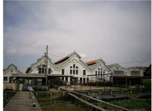
Figure 4. Kampung Assegaf 16 Ulu Palembang Settlements.