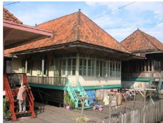
Figure 6. Panggung house at Ulu Palembang area.

The form of the house with a stage that is not so high and there are no territorial boundaries between other buildings, so between one building to another building opposite the pedestrian road leading to the settlement around.