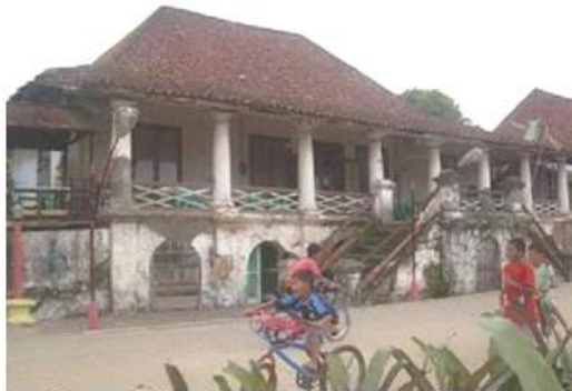
Figure 5. Settlement of Kampung Kapitan .