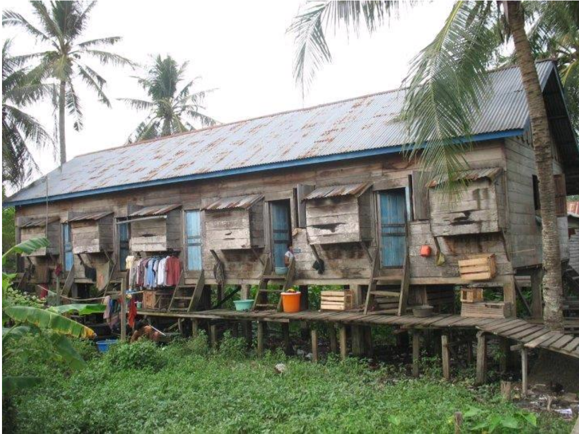
Figure7. Rumah Bedeng at Ulu Palembang Area.

At swamp land they still make the construction stage to overcome the tidal conditions, elongated building that is used for the six heads of families, they use a laundry area and bathrooms are communal. In general, residents who choose the location of the river to form a residential home.