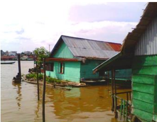
Gambar 8. Rumah Rakit at the edge of the river Musi Ulu Palembang.

At swamp land they still make the construction stage to overcome the tidal conditions, elongated building that is used for the six heads of families, they use a laundry area and bathrooms are communal. In general, residents who choose the location of the river to form a residential home.