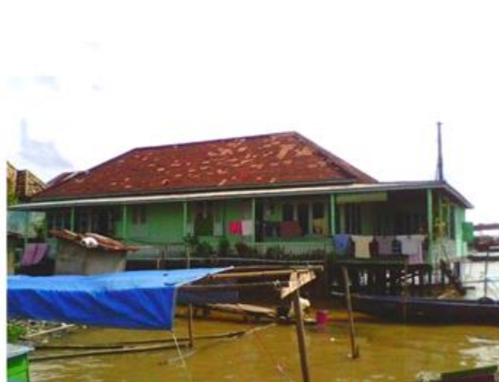
Gambar 9. Rumah Panggung the edge of the river Musi Ulu Palembang.

As for the building located on the outskirts of the banks of the river Musi, the addition of the rear