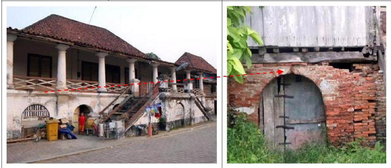
Figure 10. Tiled Brick Techniques Applied to Home Stage at Kampung Kapitan 7 Ulu Palembang.

From the location of the observation the authors found a variety of local building materials used in residential population of Kampung Ulu , such as wood unglan (Ulin), softwood, meranti wood, to bamboo, and the roof of palm leaves.