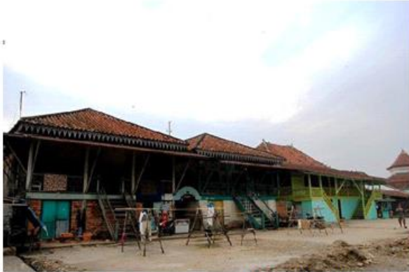
Figure 3. Kampung Arab 10 Ulu Palembang Settlements.