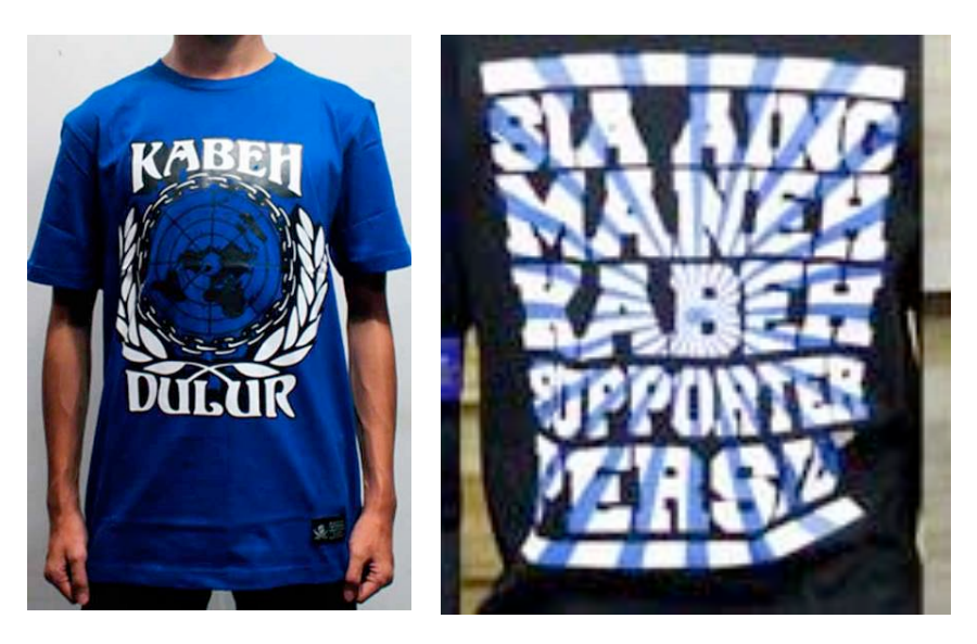
Figure 1 a Sundanese in a PERSIB supporters T-shirt

In the t-shirt worn by the supporters PERSIB, Sundanese language as the language of the West Java area is often used as copywriting in the design of the t-shirt. Usually the Sundanese language expressions contained in t-shirt voiced about the love of PERSIB or contain a call to support PERSIB.