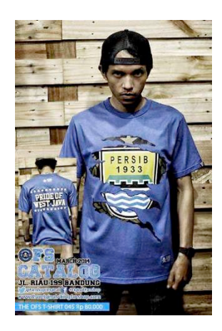
Figure 3 PERSIB logo on supporters t-shirt design

In a study of visual communication design, logo is an identity that represents an institution. As a football club, PERSIB have a logo that presented either in jersey or on other applications. By the fans, logo PERSIB often placed on media aimed at showing its support to PERSIB.