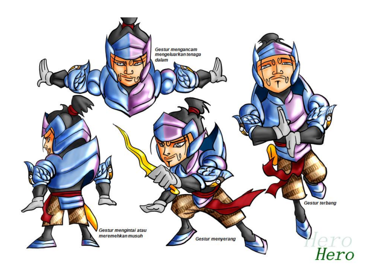
Figure. 2 . Development of Figures Krishna

What is mentioned above is actually not new. In the early days of independence of the Republic of Indonesia, for example, has emerged kind of Wayang Pancasila. The contents of the message delivered at the puppet show are the stories of struggle for independence. The Catholic Church has also been developing Wayang Wahyu, whereas in the field of education there are Wayang Kancil (Paeni: 2009). As a medium, the art of puppet show has its own technique and style,