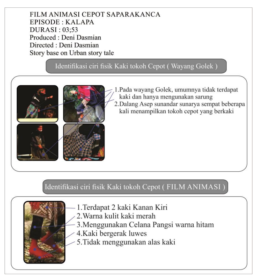
Figure 4. Identification of visual form Punakawan puppet characters Cepot and the animated film Cepot Saparakanca (works Deni Dasmian).