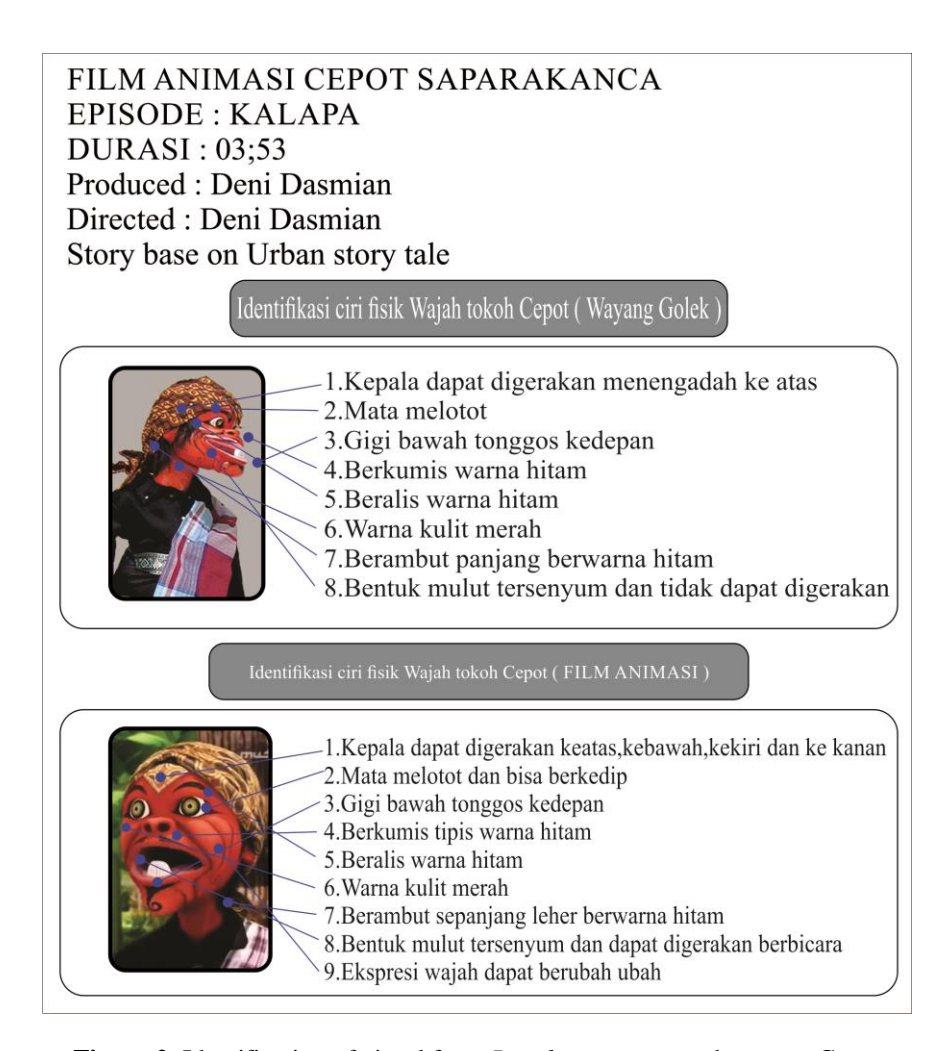
Figure 2. Identification of visual form Punakawan puppet characters Cepot and the animated film Cepot Saparakanca (works Deni Dasmian).

or objects into structured, could have a chance to become an ideology which grew in line with the existing social system. Puppet character is believed to be something of value, or as something that added value elements therein. Value is not an element of the object, but a nature, quality possessed by a particular object is considered to contain a favor. Value is also historical, social, biological, and even purely individual. As the picture below that the changes that occur in the identification of the physical characteristics only in the detail form (form) a more complete and removal of any form of media such as explanation shown below.