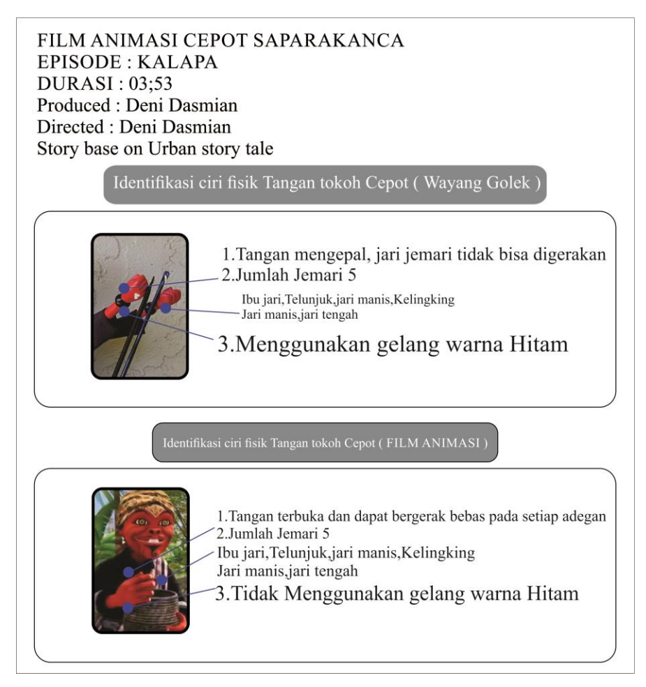
Figure 3 . Identification of visual form Punakawan puppet characters Cepot and the animated film Cepot Saparakanca (works Deni Dasmian).

Structural elements usually found on an object having a functional impact. The impact of visual form that is raised is closely related to a process that includes the determination of visual codes in conveying a message and communicative ideas. Aesthetic perception which is used as the main core in a work becomes a benchmark in delivering a technical instrument in a work of transformation of character Cepot taken from the puppet media into 3D character modeling.