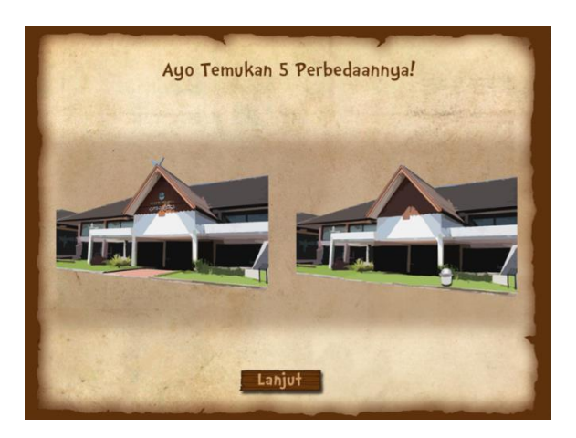
Figure 5.3 Mini-quest of Game Mari Mengenal Bandung

The challenge in this game is given in the mini-quest where players should be able to compete the mini-quest to acquire the information and knowledge about educational attractions.