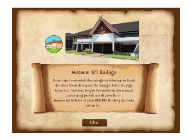
Figure 5.4 Information Display of Game Mari Mengenal Bandung