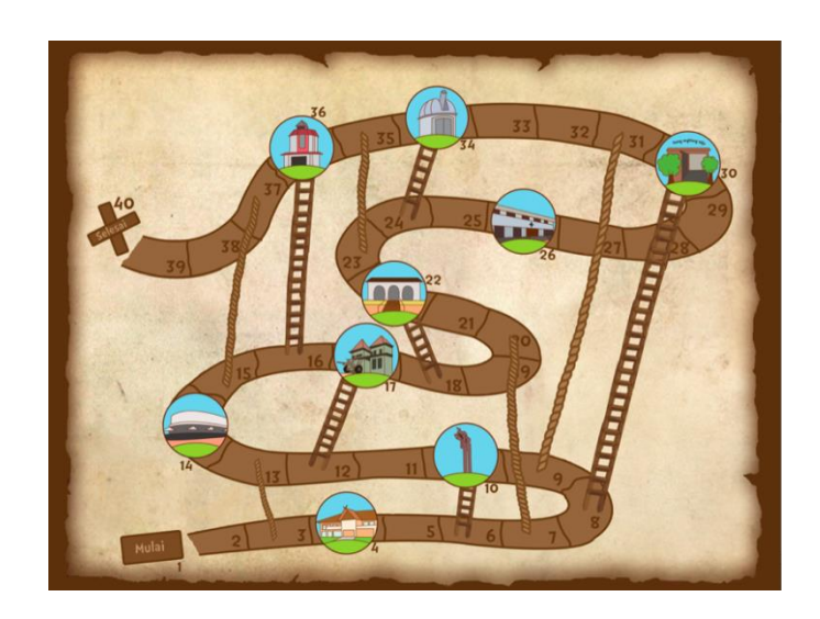
Figure 5.7 Board game Interface of Game Mari Mengenal Bandung

Players will feel like playing an adventure because the display of snake and ladder's path is like lane road on a treasure map