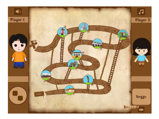
Figure 5.2 Boardgame and Headsup Display of Game Mari Mengenal Bandung

This educational game provide information and knowledge about educational attraction in Bandung, such as: