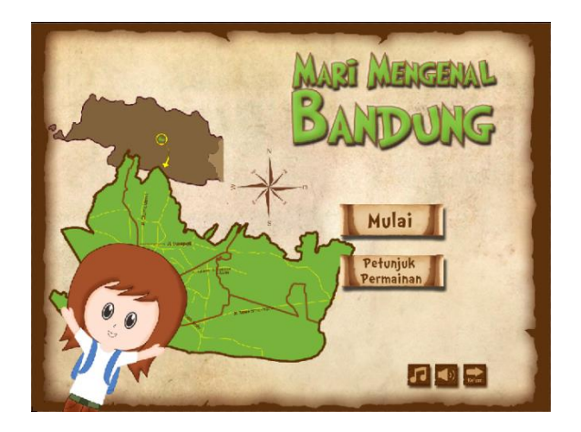
Figure 5.1 Main Menu of Game Mari Mengenal Bandung