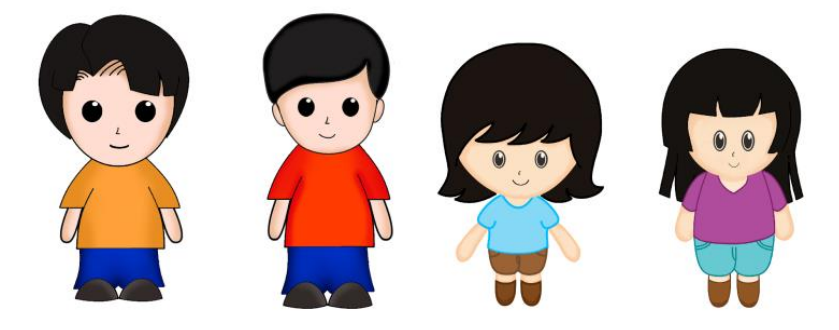
Figure 5.5. Characters of Game Mari Mengenal Bandung

There are five characters in this game. Four characters that can be used in game, acts as a pawn that can be executed by the player and one character is non-playable character (NPC), which acts as tourist who invites players to help provide knowledge about educational attractions in Bandung.