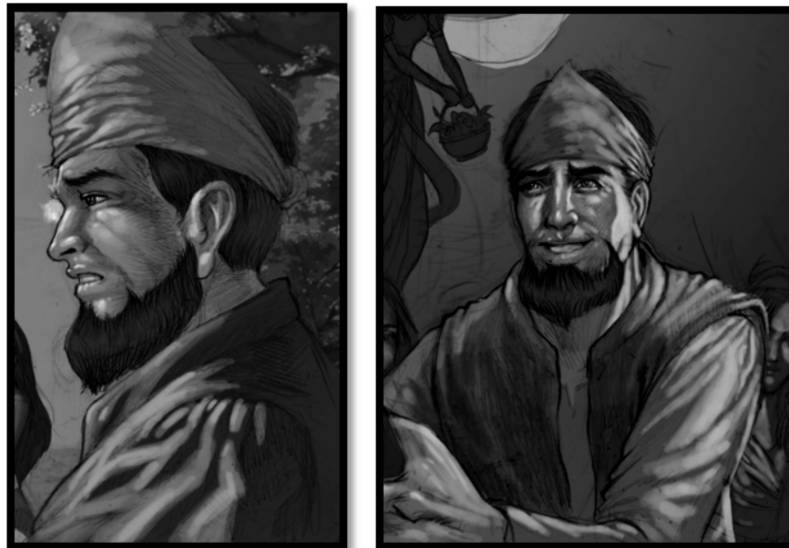
Figure 1 Illustration for Jafar Sadik (Jafar Noh)