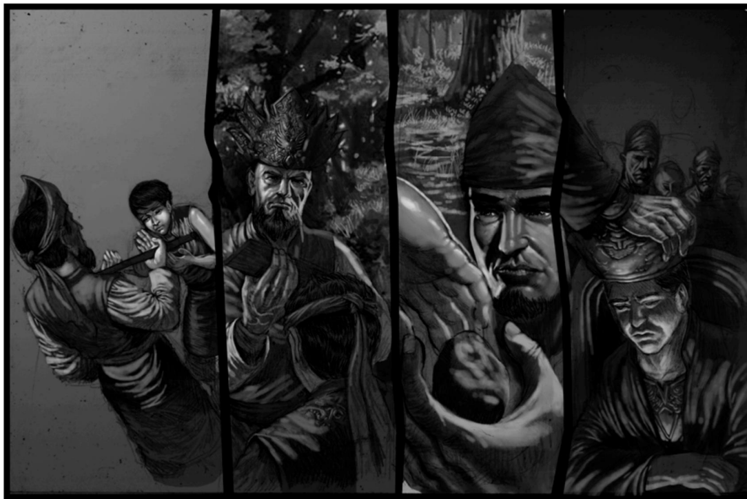
Figure 3 Illustration of Opening of the 4 Sultanate of North Maluku . Source: Personal Documentation