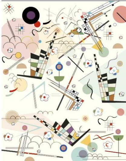
Figure 2. First Geometrical Abstract Design on Crème Background