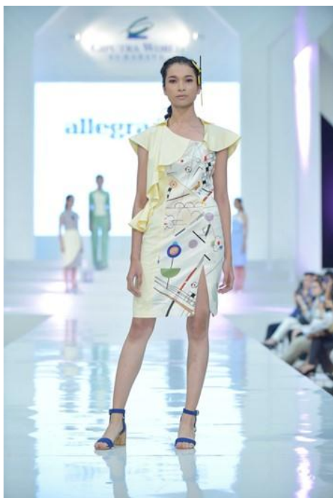
Figure 5. Women’s Wear with Satin Velvet of Digital Textile Printing

Motif in combination with Italian Cotton on solid color