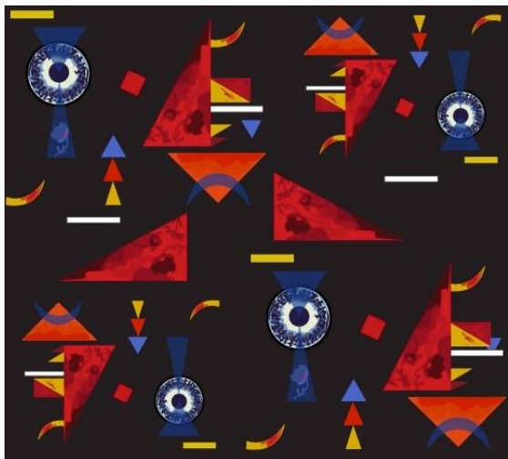
Figure 4. Third Geometrical Abstract Design on Black Background