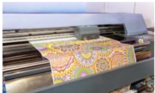
Figure 1. The printing process of digital textile print by Shrelo in Jakarta

There are geometrical abstract design motifs alongside process of digital textile printing at figure one until four; the designs are created on computer with software, later digitally printed on textile by using Satin Velvet, 100% Satin Polyester fabric with after print finished width 144 cm, approximate shrink percentage 0,5 until 1%. There are three designs used for 6 looks from the collection, each carefully placed according the areas following pattern cutting on pattern making.