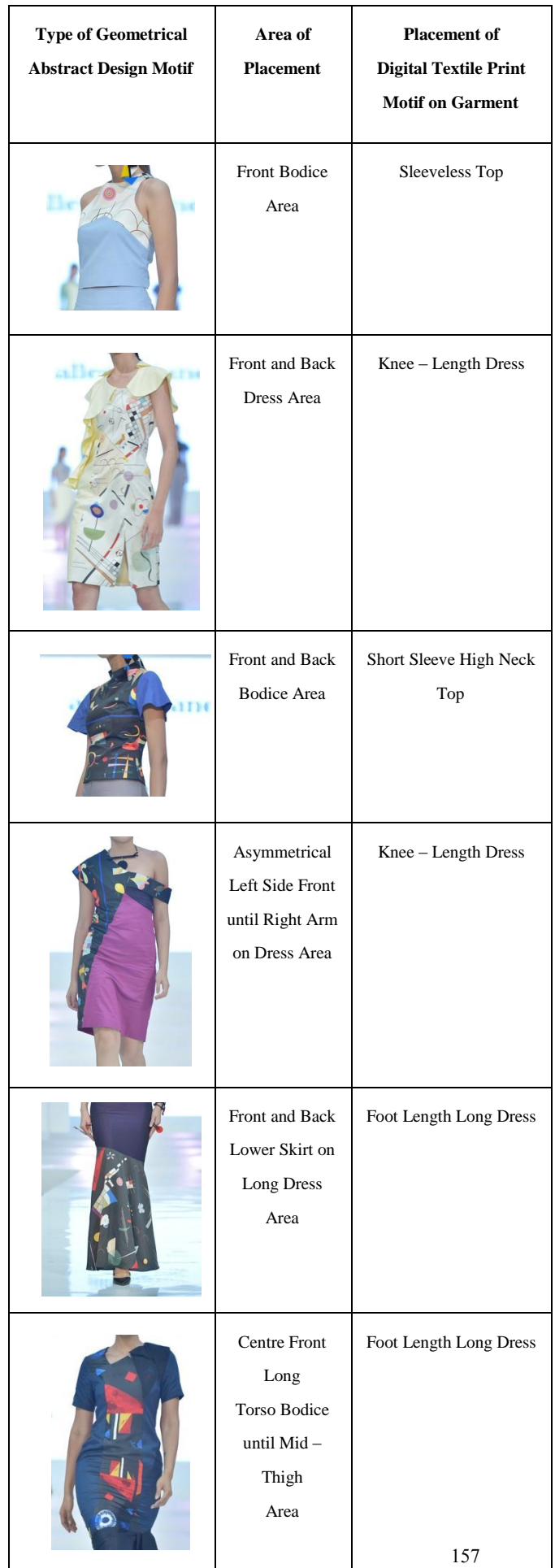
Table 1. Design Placement on Collection