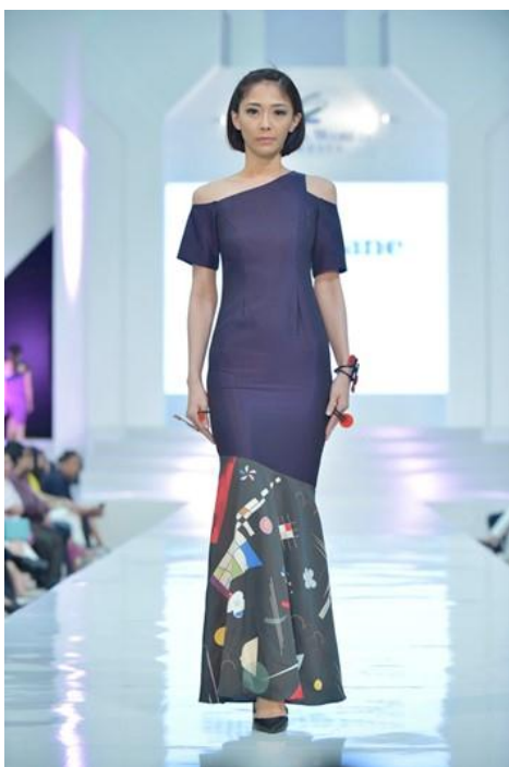
Figure 6. Women’s Wear with Satin Velvet of Digital Textile Printing

Motif in combination with Italian Cotton on solid color