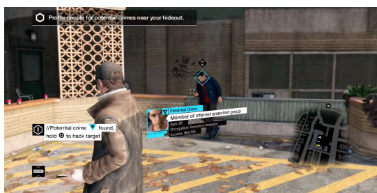
Figure 4. Hacking into someone's phone

The more data we stored in form of digital technology, the more vulnerable we are. Activities such as online shopping, e-banking, and many more; are the source of our date stored online waiting to be hacked.