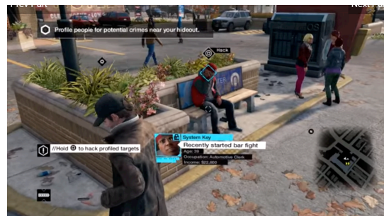
Figure 2. Condition of social life in Watch Dogs

The conditions displayed in the Watch Dogs are interesting as a reflection of today's social society. Nowadays, society is in a domain, the domain of mediated society. Almost every member of society uses a smartphone as central device to do daily activities.