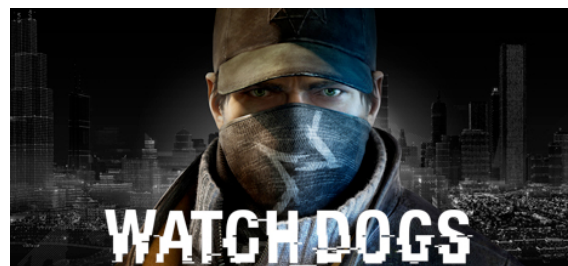
Figure 1. Watch Dogs Cover

Dog offers unique experience unlike other action game which use only firearms. In Watch Dog, the player can used hacking tool to subdue the enemy. The hacking technique is a very powerful tool in this game. Player will play as Aiden Pearce, fall from grace hacker; as a hacker your important tool is smartphone which connected all around the Chicago by certain operating system, CtOS. The ability to use hacking is a key element to progress within game's missions.