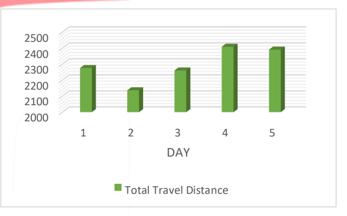
Figure I.2 One Week Travel Distance

Based on the Figure I.1 about factors causing delivery delay, the most influential factors is delay in departure. It is because PT. XYZ don't have fixed schedule of delivery and they miscalculate the departure time because of improper route determination that also leads to longer travel distance. Route determination is left entirely to driver operator therefore there's no proper calculation that can optimize the distrubution processes. They also spent a lot of time in goods unloading activity because operators have to move the milk from the vehicle into customer's refrigerator and put each cup one by one to stack the milk neatly inside the refrigerator.