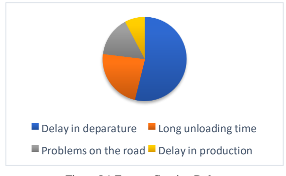
Figure I.1 Factors Causing Delay

XYZ, there are several factors that influenced than can be seen in Figure I.1.