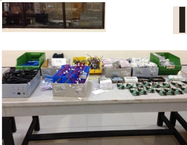
Figure 1 Component Table

PT ABC is a company that develops business and products in the electronics fields for industry and infrastructure. One of the products produced by PT ABC is E-KTP Reader. PT ABC has four workstations for assembling E-KTP Reader. Workstation 1 is used to assemble the components of the upper casing and workstation 2 used to assemble the components of the lower casing. Then, the workstation 3 is used as functional test and workstation 4 is used for the packaging process. Based on direct observation in PT ABC, component of E-KTP Reader is placed in a table without separated according to where the component will be assembled, either will be assembled in upper casing or lower casing.