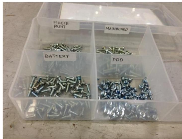
Figure 5 Labeled Bolts