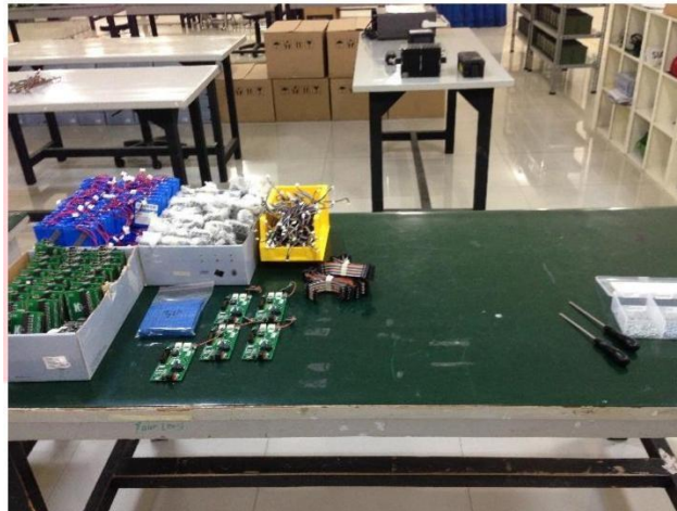
Figure 4 Proposed Working Table

Reminding the worker to maintain the cleanliness and neatness.