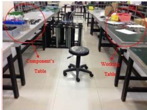
Figure 2 Working Table and Component Table

These working area is expected causing the processing time becomes long. Based on observations, process time at each workstation is greater than a predetermined time by the company. The longest process time is at workstation 2. Comparisons between the time established by the company with time observations shown in Table 1: